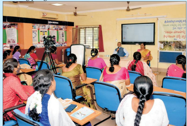
Training Program on Disease Control in Dairy Animals