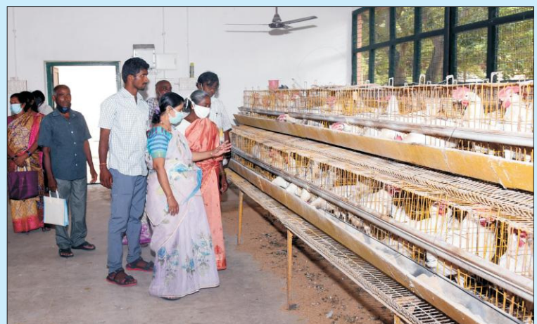
Training program on back yard poultry management