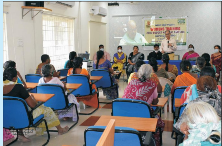
Training program organized at KVK, LAM, Guntur

Training programs (14) were carried out at KVK Guntur on kitchen garden, millets and value added products, immunity boosting foods, Integrated farming system, bio fertilizer management, Integrated weed management, Nursery management in chilli, Integrated pest management in paddy and azolla cultivation. Training programs (18) on Integrated crop management in chilli, Back yard poultry, Seed production techniques, Bio-fertilizer management, Seed production in black gram, Nutrient management in pulses, Weed management in black gram, Disease and pest management in Beekeeping, Thrips management in chillies, prevention of malnutrition, personal hygiene for adolescent girls were also carried out at KVK Guntur.