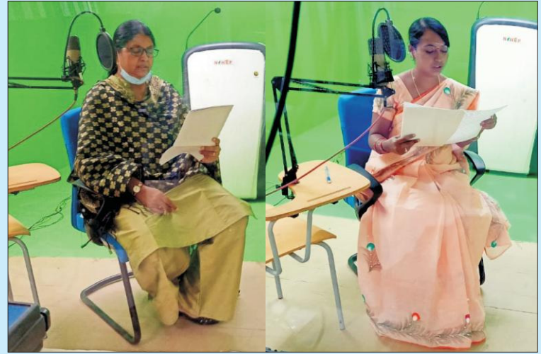
Radio Talks at SVVU Digital Studio

vacchu svaasakosa vyaadhulu - vaati chikista mariyu nivaarana padhathulu.