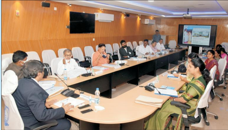
73 rd Board Meeting of Sri Venkateswara Veterinary University