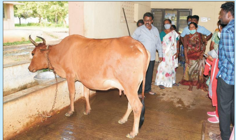
Training program on Dairy animal management