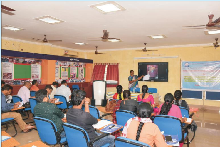
Refresher training program for Veterinary Assistant Surgeons