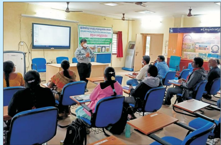
Training program to Para Veterinarians