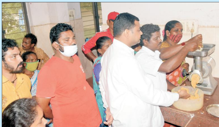
Training programme on Value added meat products

A training program on “Value added meat products” was organized by CCVEC on 16 th November 2021 with an objective to orient the farmers on different meat products and their preparation. Farmers from Chandragiri and Tirupati mandals, Chittoor district have attended the training.