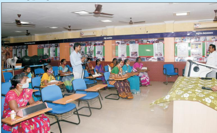
Training program on Importance of Fodder production