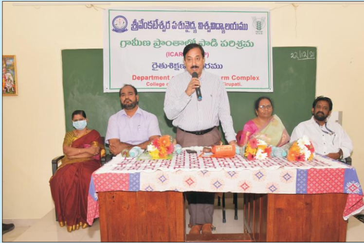
Training program on Dairy management in rural areas