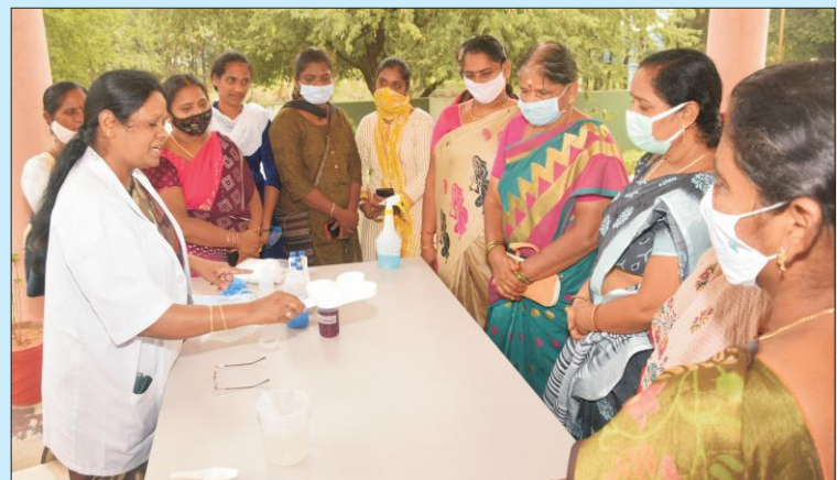
Perform Mastitis Diagnosis Test