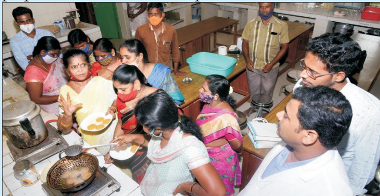
Training programme on Value added meat products