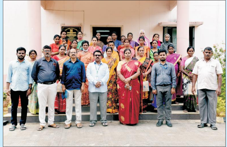
Training Program on Sheep and Goat Management